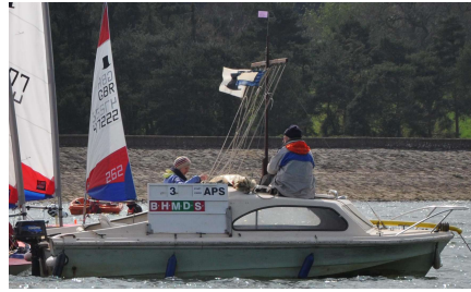
The course board